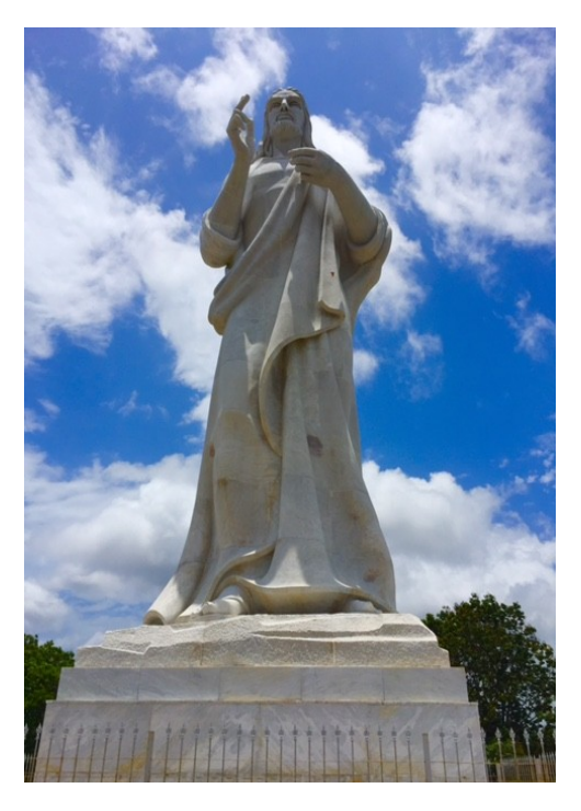
"Shoe the Children Without Shoes on Their Feet"