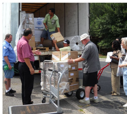
Trinity Children's Center Staff unloads 600 lbs. of athletic shoes, socks, and hygiene kits - destination, Monrovia, Liberia.