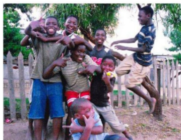
Children in South Africa