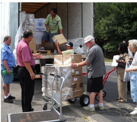
Trinity Children's Center Staff unloads 600 lbs. of athletic shoes, socks, and hygiene kits - destination, Monrovia, Liberia.